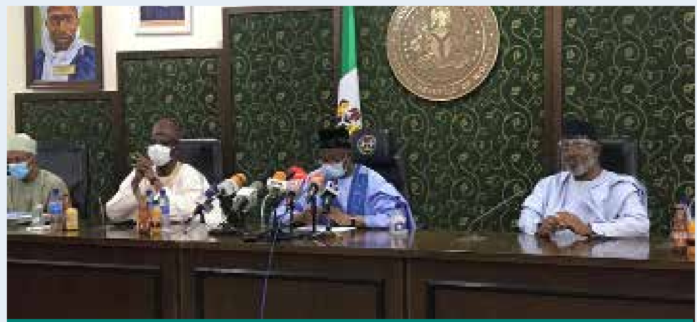
Bauchi State Governor Senator Bala Abdulkadir Mohammed, Kauran Bauchi while addressing the NAHCON delegation when they paid him a working visit in Bauchi state Government house

He identified Bauchi as one of the key stakeholder in the hajj Affairs in the country, appealed to the Governor not to relent in supporting the Commission for better performance.