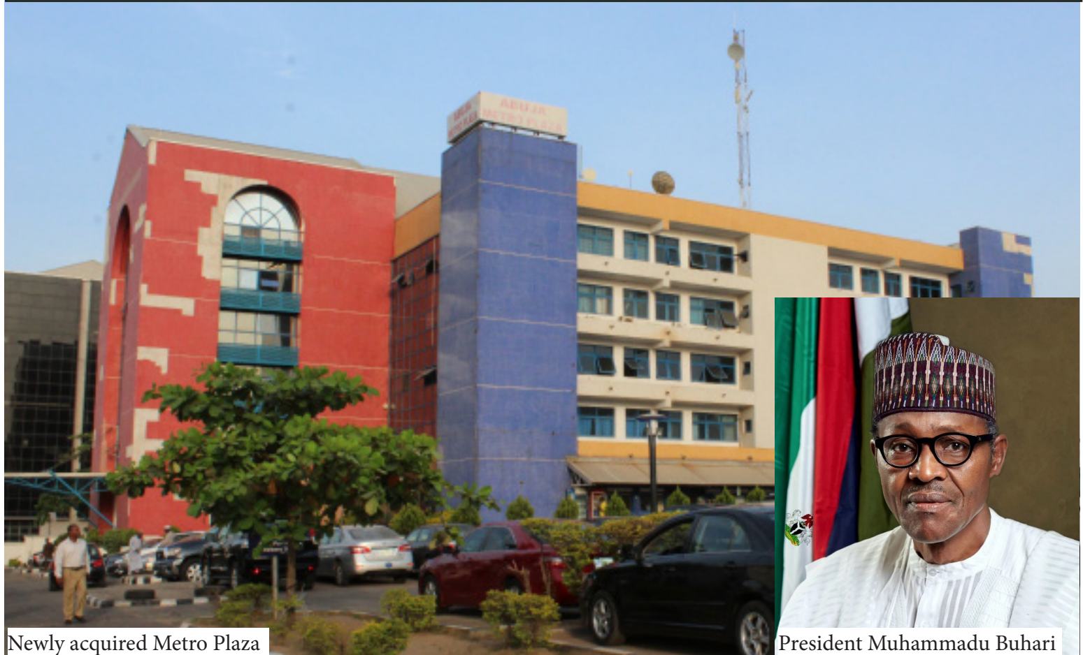
Newly acquired Metro Plaza