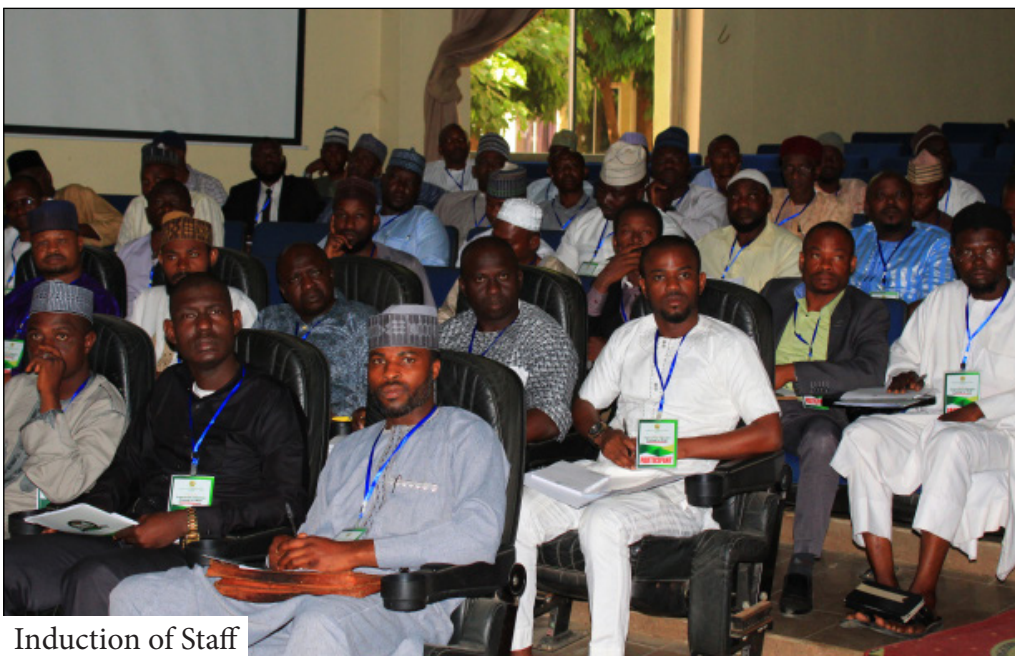
Induction of Staff