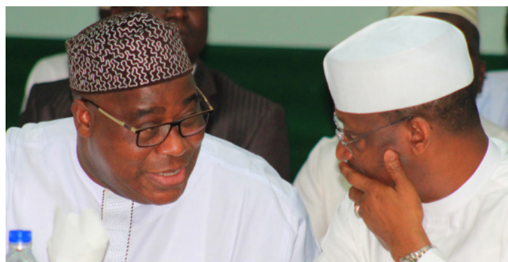
Chairman/CEO discussing with Commissioner PPMF