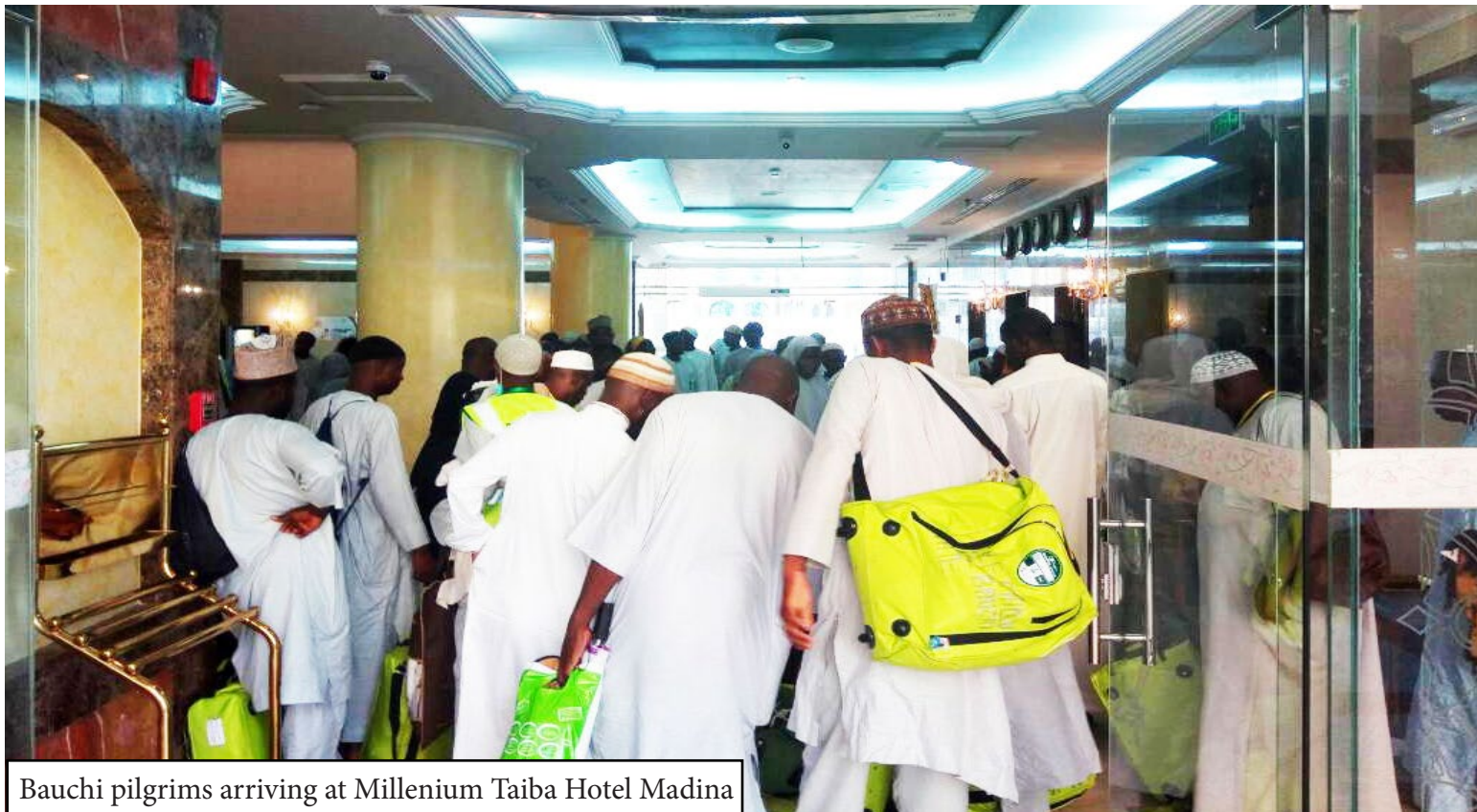
Bauchi pilgrims arriving at Millenium Taiba Hotel Madina