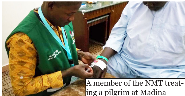
A member of the NMT treating a pilgrim at Madina