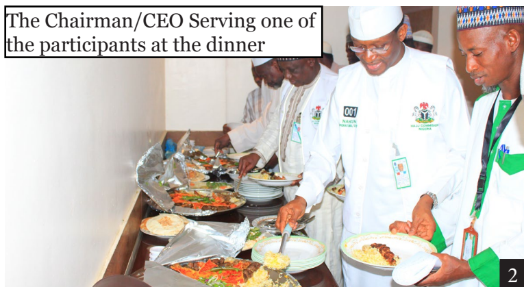
The Chairman/CEO Serving one of the participants at the dinner