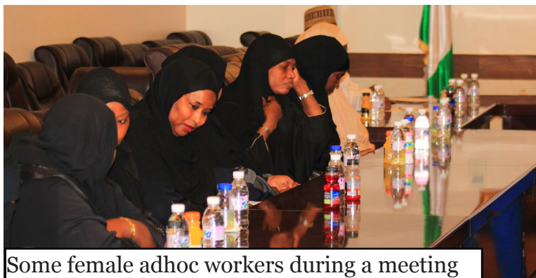
Some female adhoc workers during a meeting