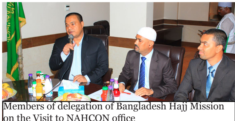
Members of delegation of Bangladesh Hajj Mission on the Visit to NAHCON office