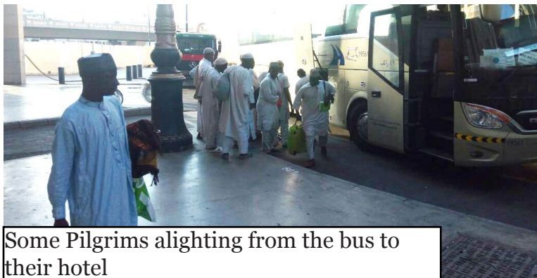
Some Pilgrims alighting from the bus to their hotel