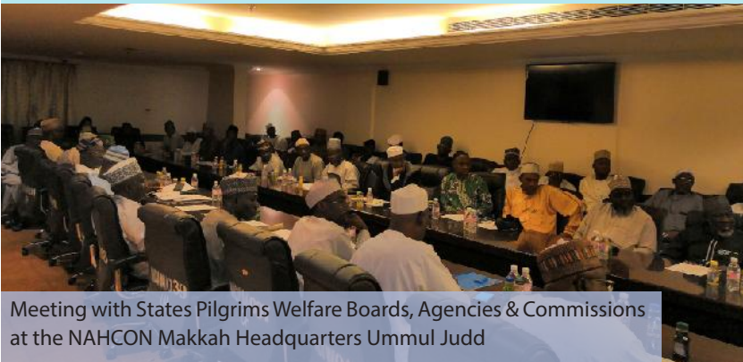
Meeting with States Pilgrims Welfare Boards, Agencies & Commissions at the NAHCON Makkah Headquarters Ummul Judd