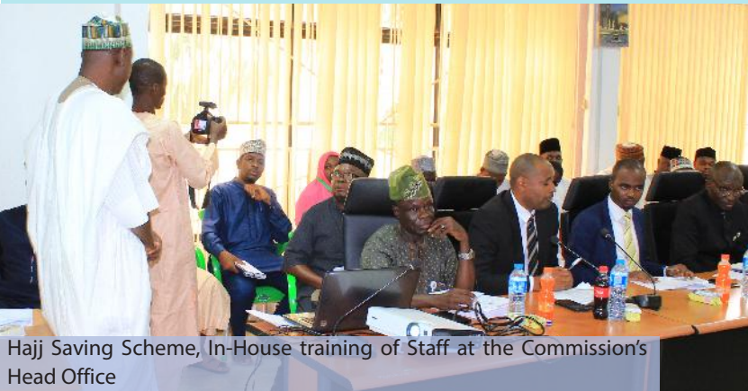
Hajj Saving Scheme, In-House training of Staff at the Commission's Head Office