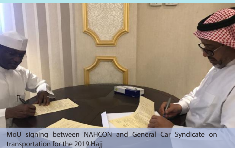
MoU signing between NAHCON and General Car Syndicate on transportation for the 2019 Hajj