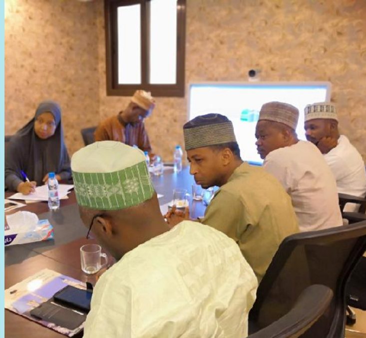
E-Track Meeting at Ministry of Hajj & Umrah Makkah