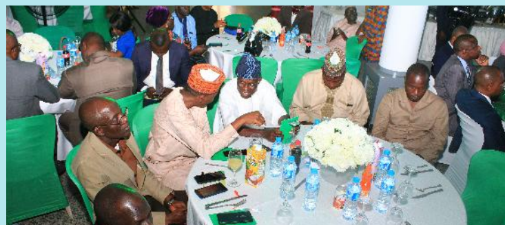
Members of staff during the SGF merit award at the Musa Yar'adua center Abuja