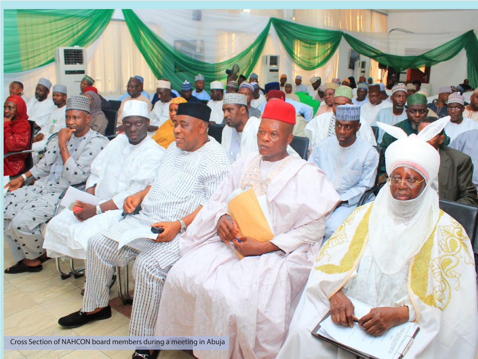
Cross Section of NAHCON board members during a meeting in Abuja