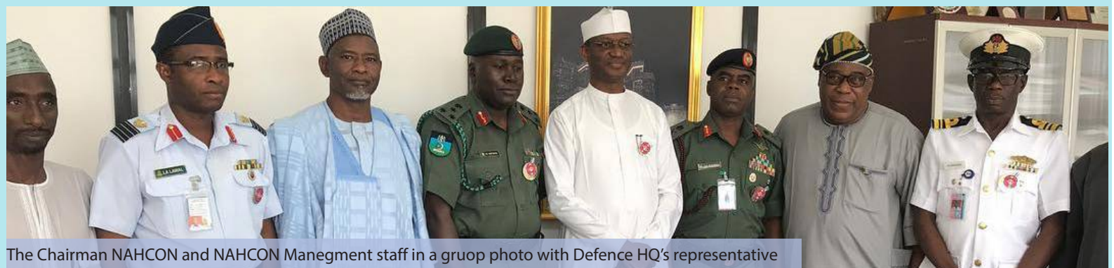
The Chairman NAHCON and NAHCON Management staff in a group photo with Defence HQ's representative