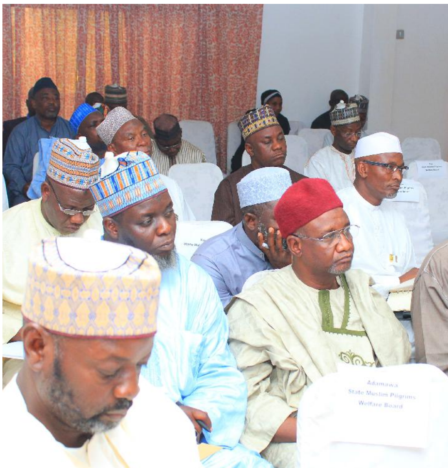
During a meeting with State Pilgrims welfare board chairmen, Secretaries and Directors

The policy is that if you perform 'Umrah in consecutive Hijri years then you will have to pay a charge on the second time you apply for a visa. So that means if you did 'Umrah at the beginning of a Hijri year, you would have to actually wait virtually two full years before you can do 'Umrah again without a new fee".