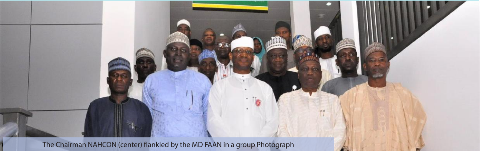
The Chairman NAHCON (center) flanked by the MD FAAN in a group Photograph