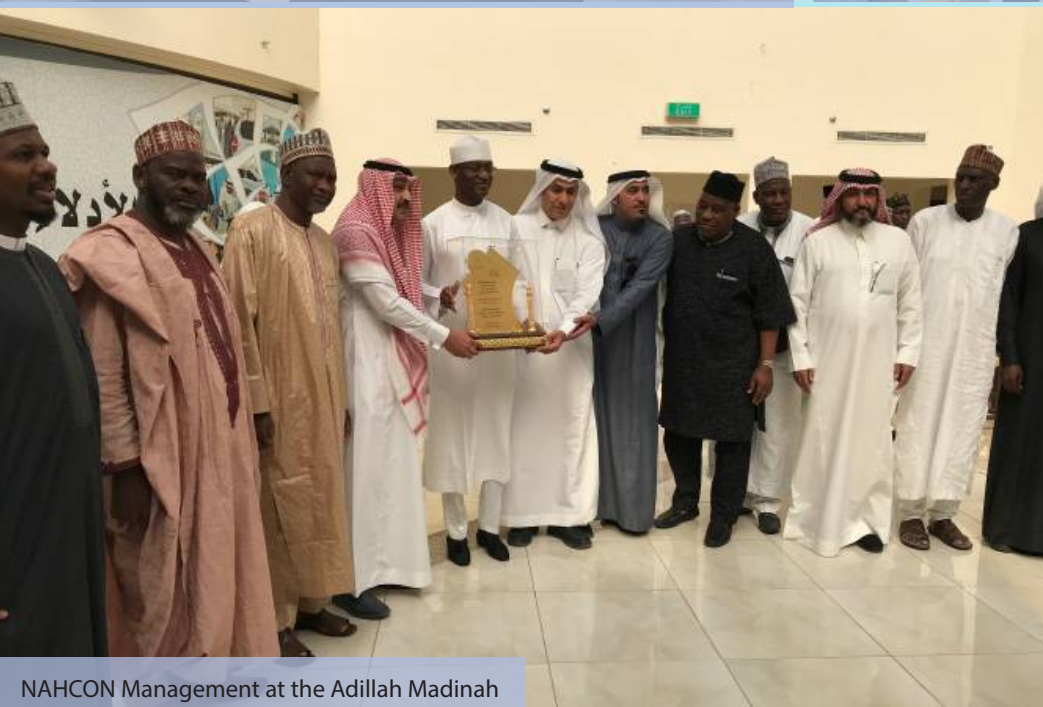
NAHCON Management at the Adillah Madinah