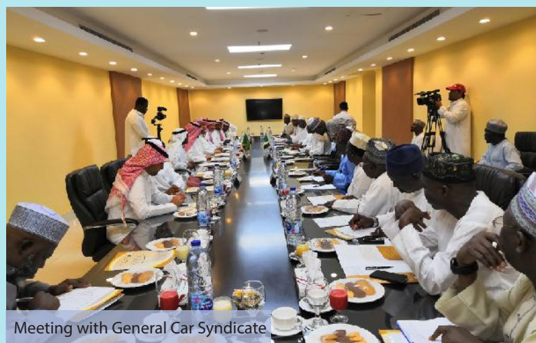
Meeting with General Car Syndicate