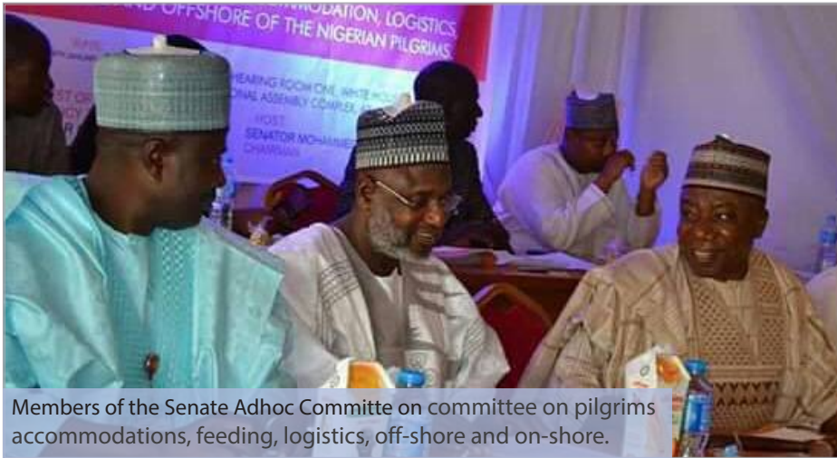
Members of the Senate Adhoc Committee on committee on pilgrims accommodations, feeding, logistics, off-shore and on-shore.

A third suit is before another court in Kano with no K/332/2017. Similarly, one of matters raised has a subsisting judgment from General Court of Makkah no 392776 delivered on 5th Muharram, 1439 AH.. "The Senate has established a reputation of being the vanguard of justice for Nigerians. It has upheld the highest standards of legislative practice and procedures. It must not allow the subjective view of a few to derail it from this onerous responsibility. "The Commission still maintains that the increase in the 2017 Hajj fare was as a result of the rise in the exchange rate from NGN197 /1USD in 2016 to NGN305/1USD in 2017. All we appeal for is fairness to all concerned as the report in its totality is unfair to the Commission, State Pilgrims Welfare Boards/Commissions/Agencies.