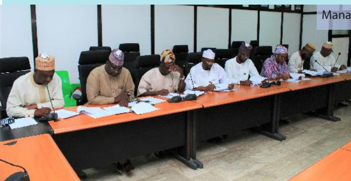
Management Meeting in Pictures