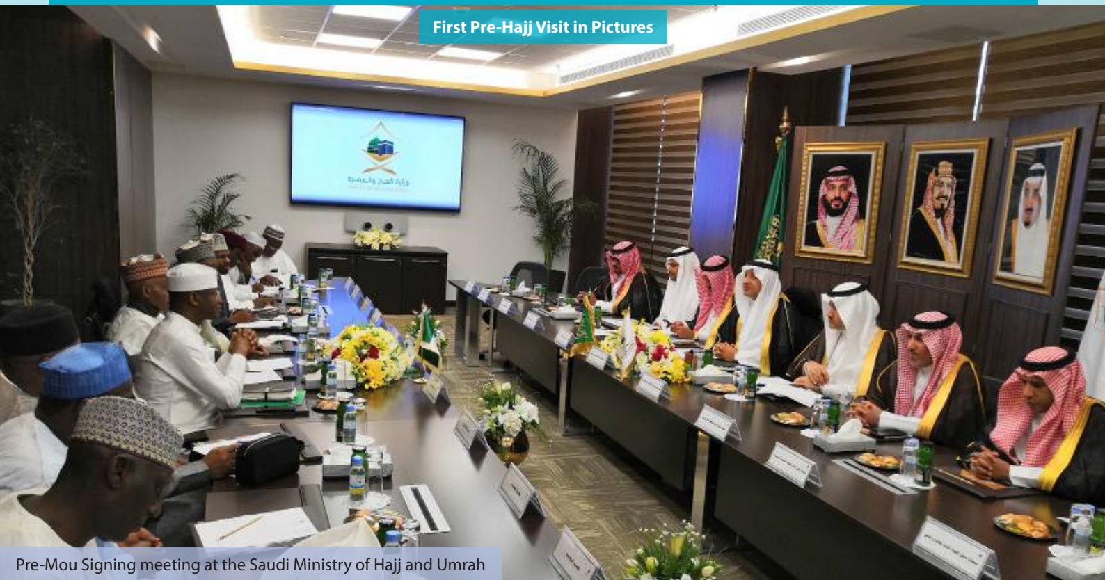
Pre-Mou Signing meeting at the Saudi Ministry of Hajj and Umrah