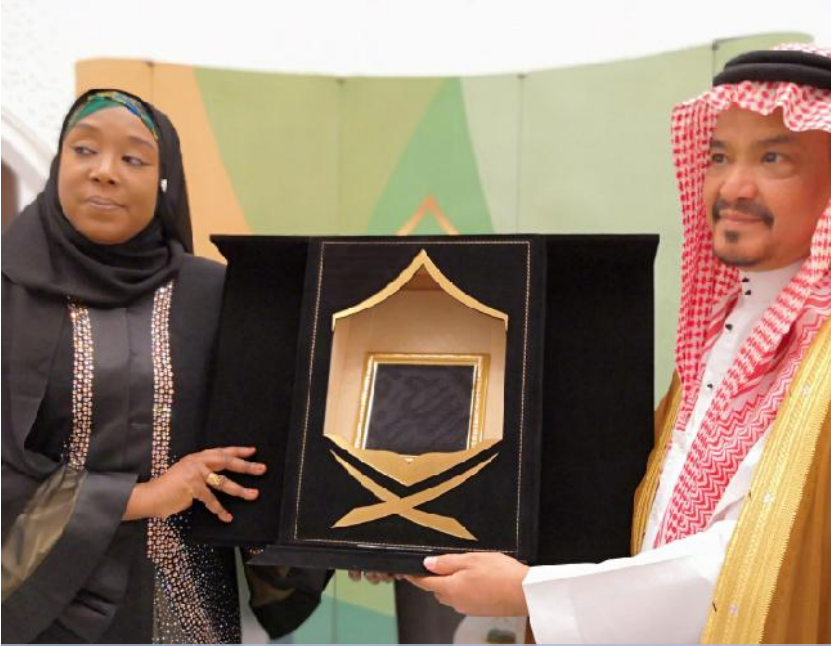
Nigeria's Minister of state, Foreign Affairs, Hon. Khadija Bukar Abba Ibrahim and Saudi Arabia's Minister of Hajj & Umrah Dr. Muhammad Saleh Benten