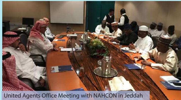
United Agents Office Meeting with NAHCON in Jeddah