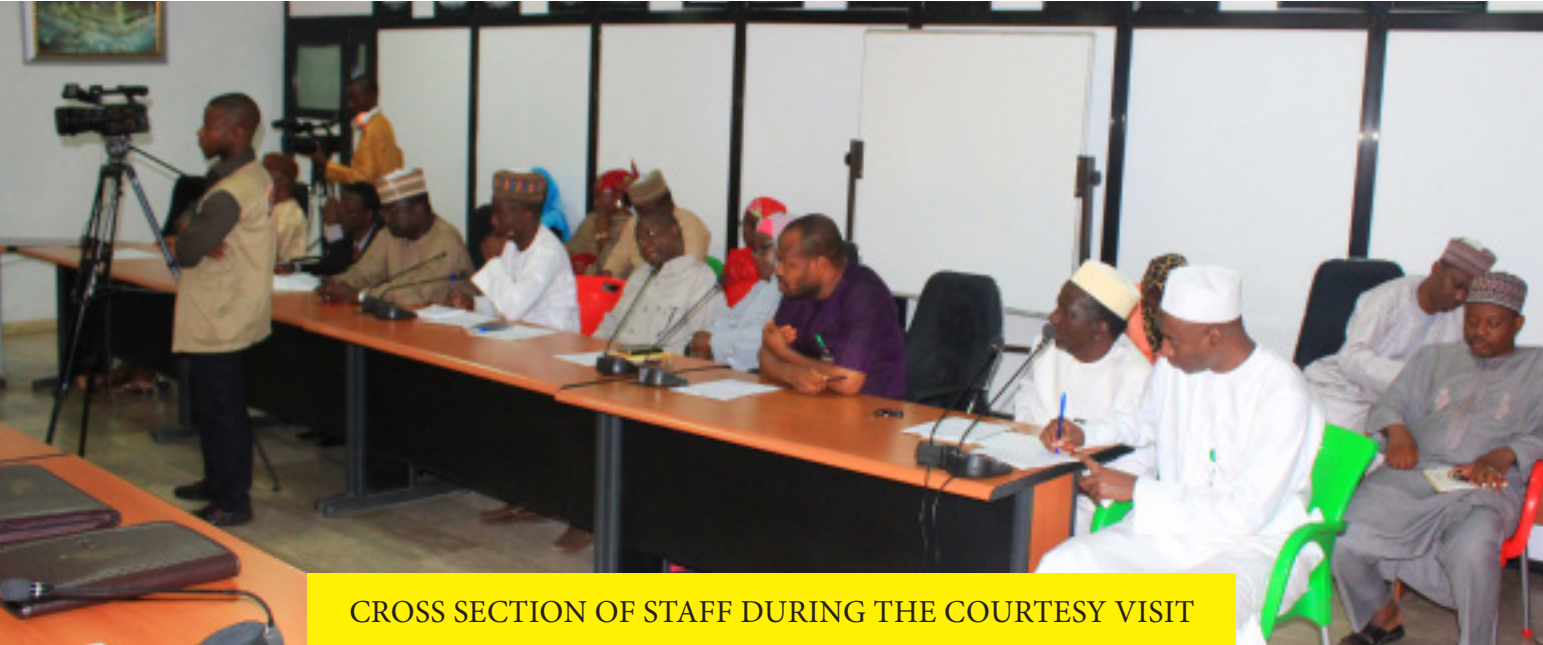
CROSS SECTION OF STAFF DURING THE COURTESY VISIT