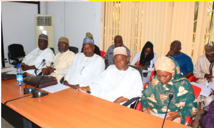
CROSS SECTION OF THE EXECUTIVES OF AHUON